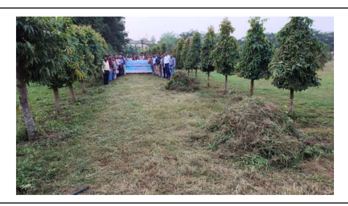
After the swachhata drive