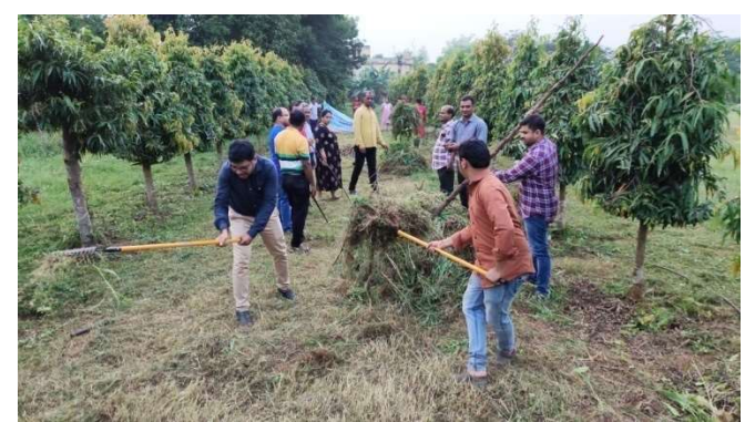
Swachhata activities being performed by the staff and scholars of the Institute